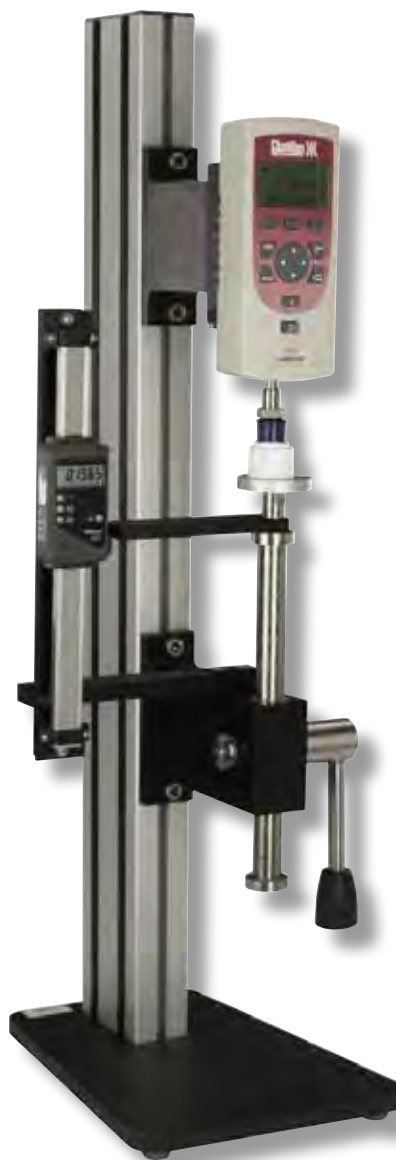
Shown: MT150L Series with optional Chatillon DFE Series digital force gauge and optional digital travel indicator.